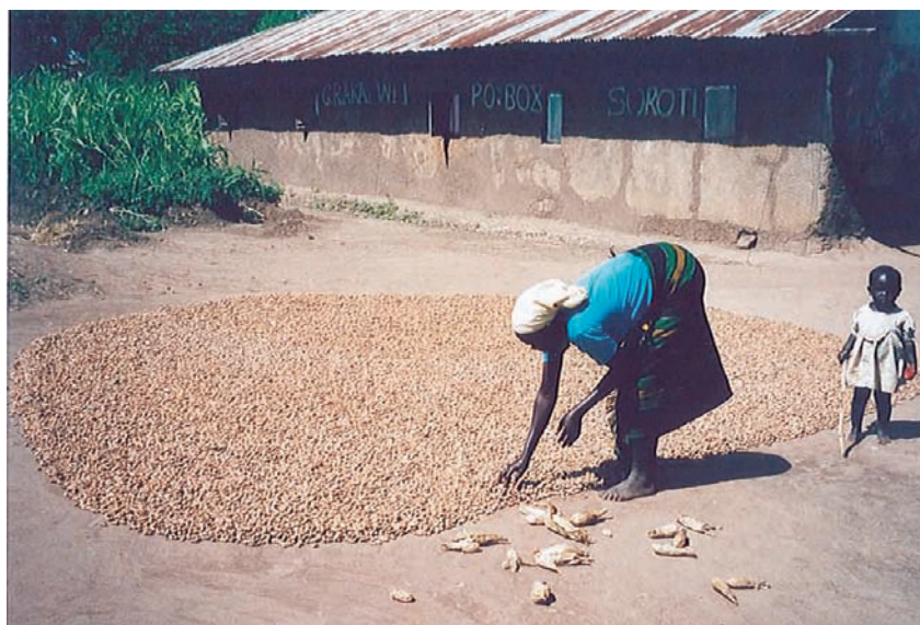
Traditional drying of groundnuts (Soroti)

disease was known by the local name of atikuba and the range of available varieties and their qualities were collated. Specific information was fed back into the breeding programme at SAARI and used to refine the criteria used for assessing new breeding lines. Other important survey findings related to how farmers obtain information on farming practices. The information obtained – that very different approaches are needed to reach different categories of farmer – was used to guide the project's dissemination strategy.