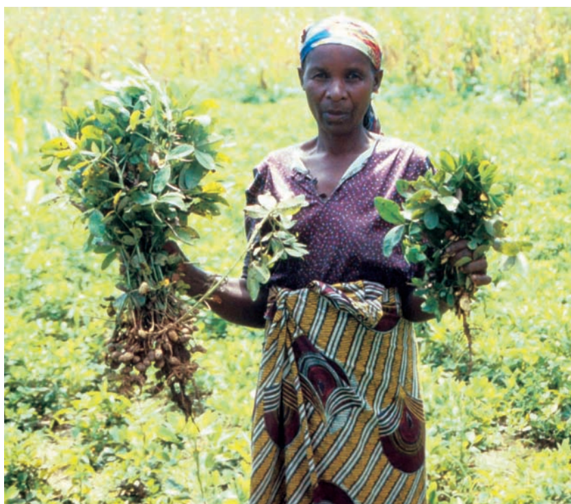
Rosette-resistant plants (left) improve groundnut yields

A large-scale household survey was conducted in three districts in the Teso farming system of north-eastern Uganda, and a database was compiled of social and economic data related to groundnut production, including groundnut rosette disease. The survey found that farmers consider several traits when selecting a groundnut variety, including drought resistance, duration, quality characteristics, yield, and pest and disease resistance. Rosette