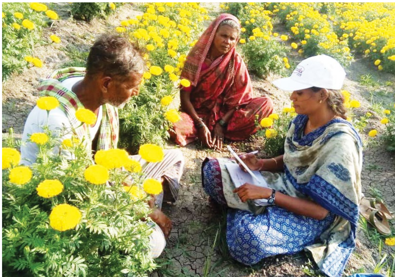
Interview with cotton farmers on their field.