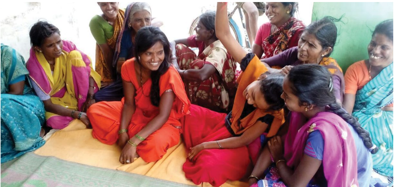
Focus group with women.