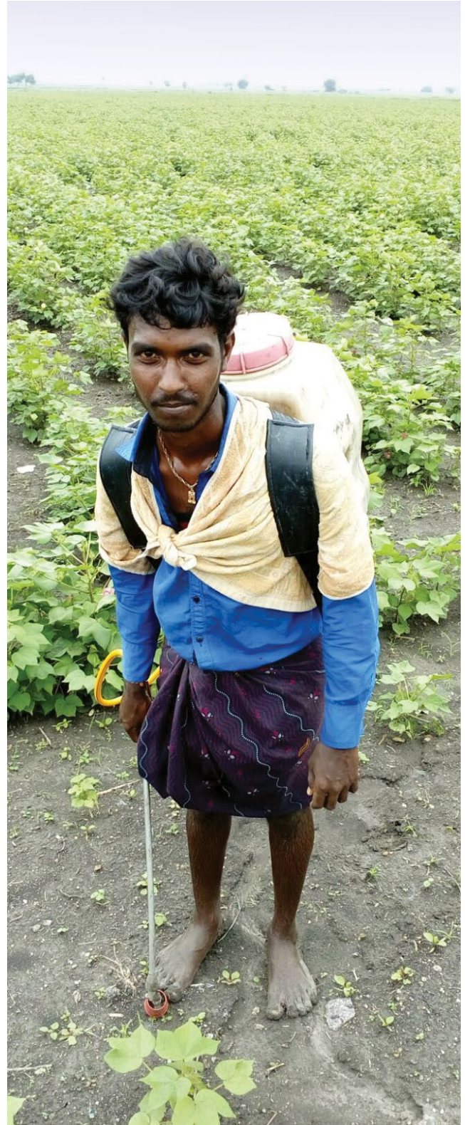
Farmer spraying without personal protective equipments.