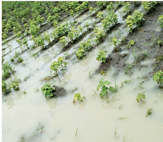
After the rains in a cotton field.

partial adoptions, etc. It is therefore important for BCI and implementing partners to unpack the notion of 'adoption'. The BCI approach did not include strong experiential learning as facilitated in farmer field schools and farmer networks, yet the latter may be more effective in achieving change in contexts where there are strong countervailing forces.