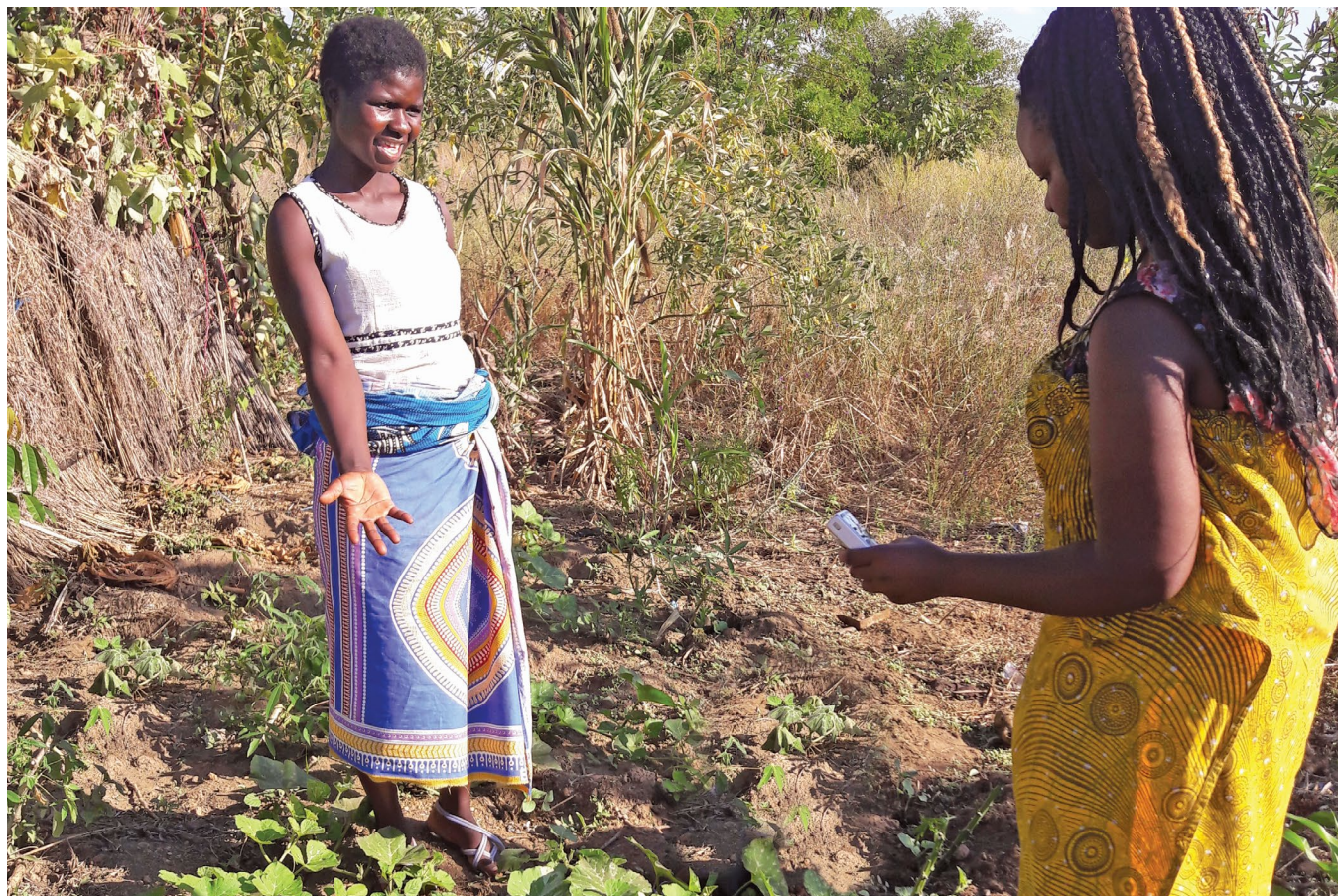
Home gardening, Neno District.