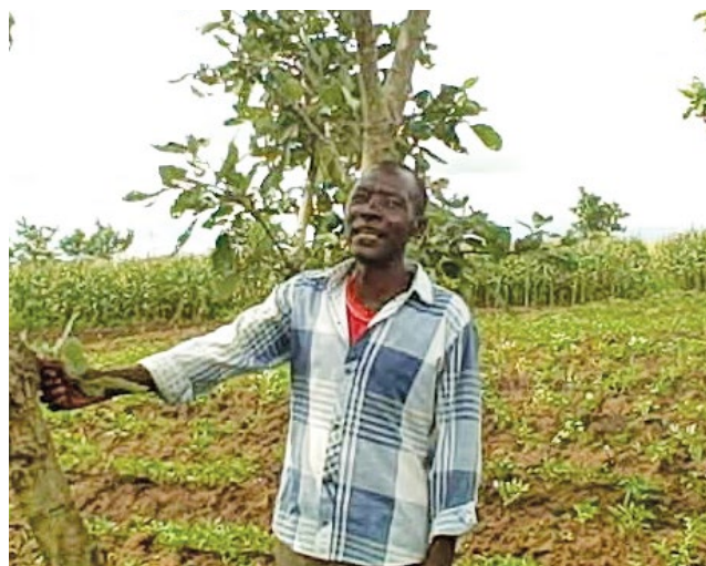
Sweet potato and retaining 'natural' trees in Farmer Field School learning plot, Zomba.