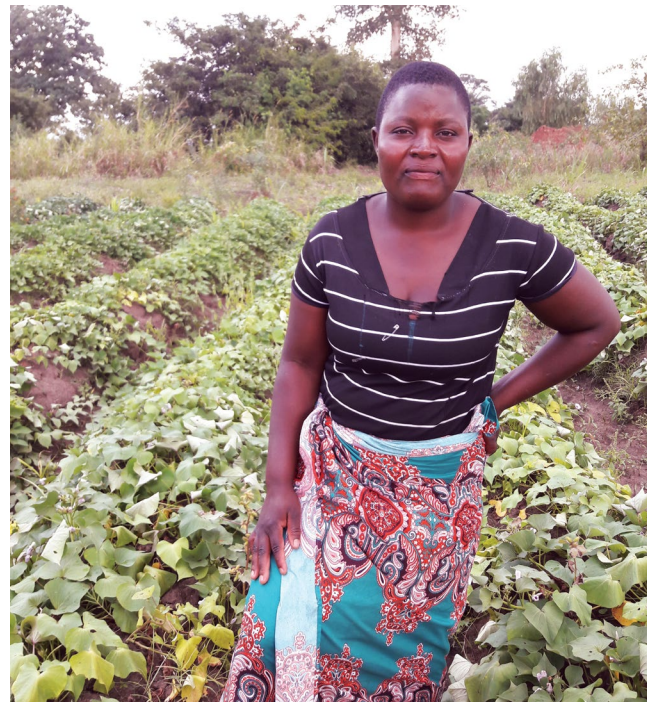
Diversified dimba cropping, Phalombe.

The study objectives are to explore: i) if and how Farmer Field School processes are effective and what is their impact, and for whom, in strengthening community resilience? ii) what lessons can be learned about how to improve Farmer Field Schools for strengthening climate resilience? Using theory-based evaluation, a Theory of Change (ToC) was developed with project staff, focused on Farmer Field Schools (Figure 1) within the broader asset building and diversification approach. Project implementation and targeting are anticipated to lead to (mutually reinforcing) capacity and practice changes, which in turn lead to benefits and impacts for participating farmers, as well as scaling in their wider community and beyond.