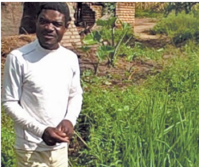
“This is a learning plot for my household” (e.g. rice, cocoyam)

‘Traditional technology transfer’ approaches are ineffective in improving farmer livelihoods and climate resilience. Smallholder farmers in Malawi, and elsewhere in Sub-Saharan Africa, are managing household farm systems which are complex and uncertain, unlike monocultural farming systems. They often lack access to necessary resources as well. Such farmers have always had to make difficult decisions between the options open to them, e.g. choices about which combinations of crops to grow and livestock to keep, what food to eat and how to earn income. Investing more in one aspect of their farm or activity, may mean less investment in something else – in other words, there is a trade-off in the livelihood (and environmental) outcomes. Increasing climate variability and other rural stresses, such as land scarcity, are making the daily trade-off decisions that farmers have to make ever more difficult.