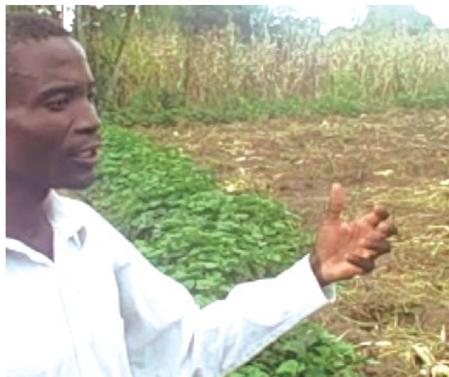
Sustainable intensive dimba cultivation, Phalombe.

Provision of key inputs has been important to those who have received them. For some, the inputs have provided new farming and livelihood opportunities, but the process of distribution is challenging. The issue of dependency remains in some groups.