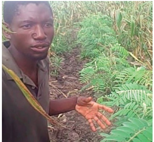
Farmer Field School member explaining their idea of using extract from a local shrub for a Fall Army Worm control experiment.

Farmers have identified market development activities as a priority.