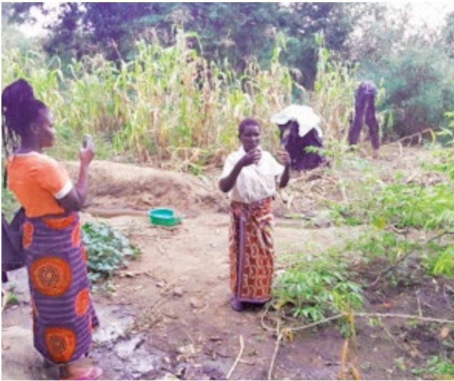
Farmer explaining her learning and change, which was recorded on video and used as a tool for group to reflect on their climate resilience.

There were also cases of participants dropping out, including quite a significant decline in the Neno Farmer Field School during the case study period. The reasons given by remaining participants and by the (limited) drop-outs interviewed are highly variable. They included people leaving the village for economic or social reasons, distance to be travelled to the Farmer Field School learning plot, tensions within the group, as well as expectations not being met.