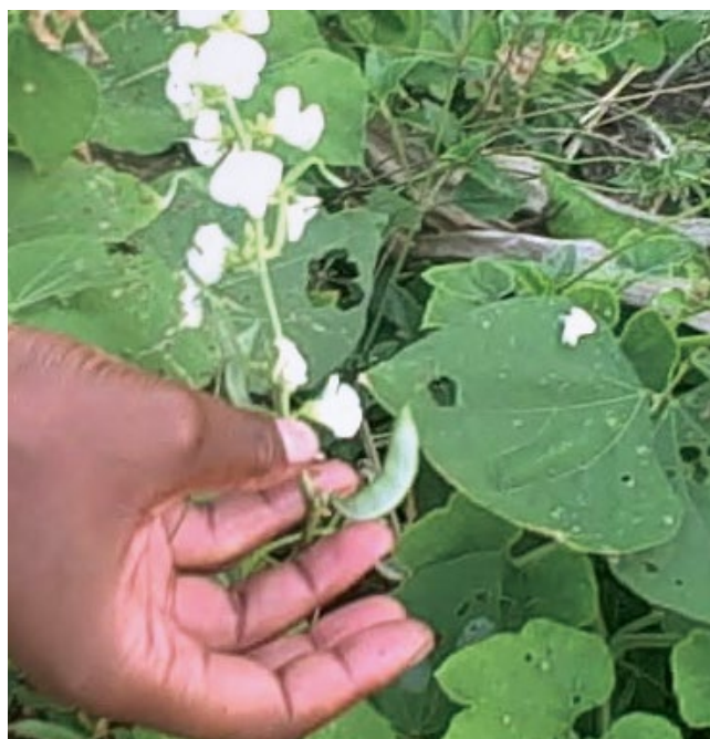
Resilient crop diversification: Buffalo beans.

School projects only engage with better off farmers. Other agricultural extension approaches work with lead farmers who tend to have relatively better access to resources. Overall, both women and men are highly positive about the Farmer Field School process, but an important reason why some members are less positive is that they had higher initial expectations regarding provision of inputs.