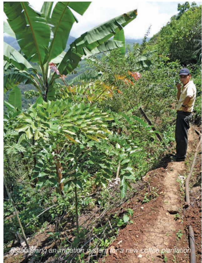
Establishing an irrigation system for a new coffee plantation

Cepicafe have used the 10% from carbon credits to leverage substantially larger funding for climate adaptation from USAID through the US fair trade company Equal Exchange. They now have over $100,000 to support renovation of coffee and increase the resilience and adaptation of the coffee farms to climate change on over 600 farms in the Canchaque district. Amongst the adaptations local farmers say that the traditional “typica” coffee variety no longer produces well under the current climate and they have been renewing areas with more productive varieties. However, in years of high rainfall leaf spot disease has caused widespread defoliation and crop loss, so farmers are changing the shade trees to include taller growing timber trees, that they think helps prevent this disease and are more appropriate for the new coffee variety. This is complemented with credit provided by Cepicafe to buy organic fertilizer and tools. Also they are investing in new more efficient sprinkler irrigation systems to plant new areas of coffee together with food crops to meet their family’s needs. Furthermore the local associations have allied with the municipalities to produce tens of thousands of trees to reforest both on their farms and in community reforestation plots.