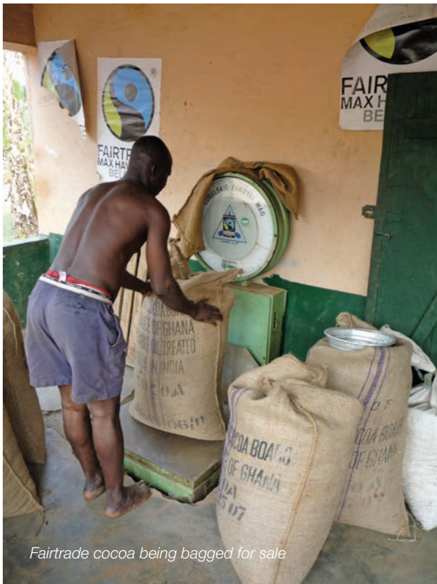
Fairtrade cocoa being bagged for sale

Kuapa Kokoo represent 65,000 small-scale cocoa farmers in Ghana. The farmers depend on land handed to them by their parents, but the trees on the land are not theirs. Timber companies buy concessions from the government and fell the large forest trees giving shade to the cocoa. Annual deforestation in Ghana is 220 km 2 per year, only 8km 2 is reforested. This directly affects cocoa farmers by increasing the drought stress on the cocoa and overall increasing temperature and the severity of the dry season. Because the cocoa plantations are old, without shade and little fertilization the productivity is falling. Although Kuapa Kokoo gets paid a Fairtrade premium which is passed on to the farmers and their communities, the income from the cocoa, their only source of income, barely meets the needs of their families.