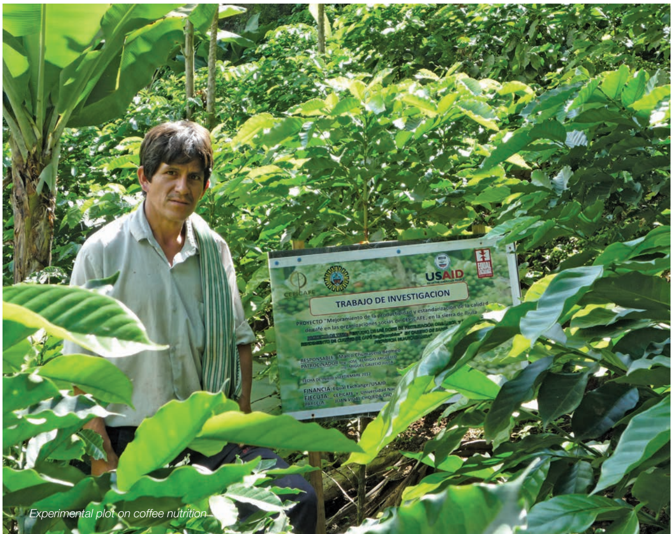
Experimental plot on coffee nutrition