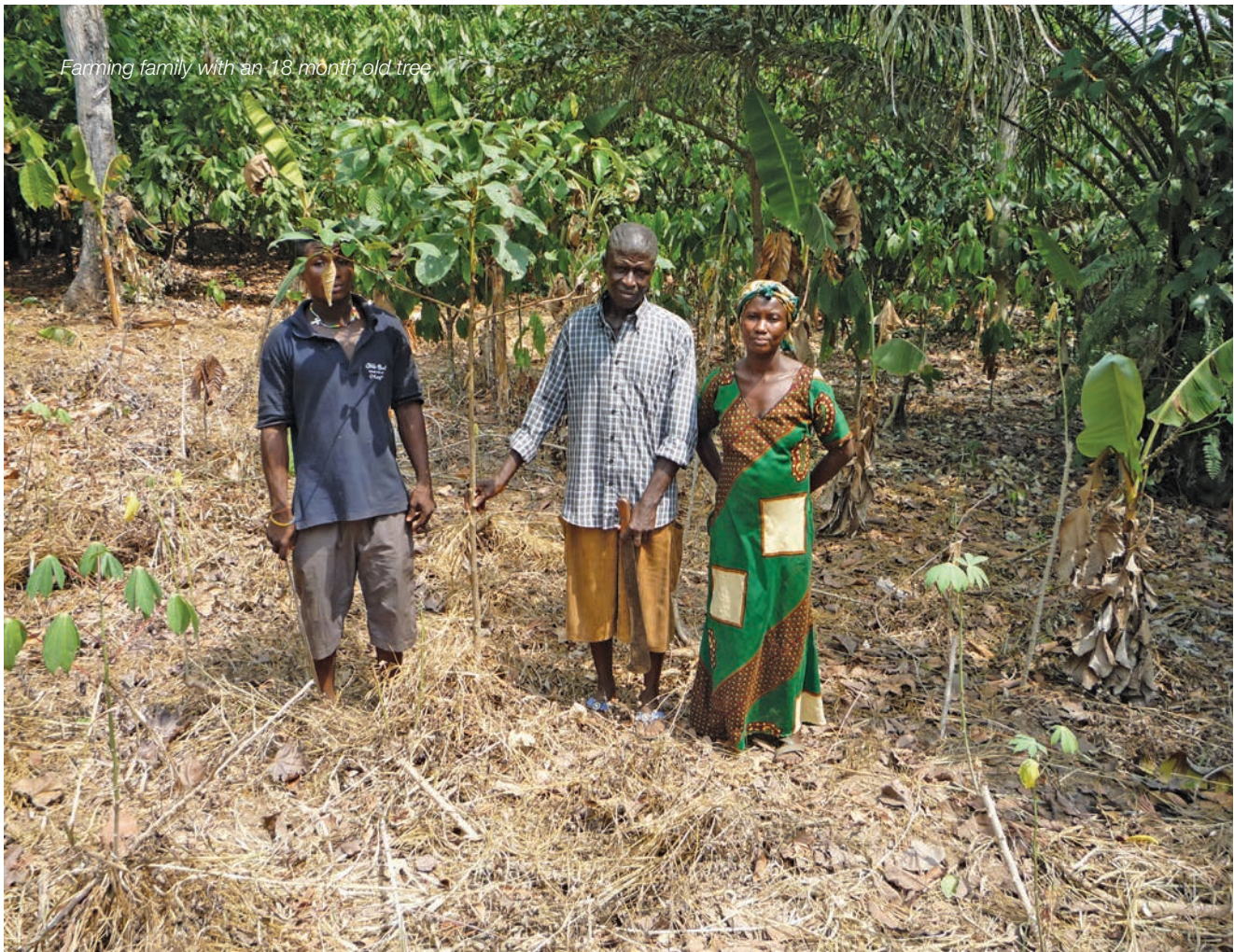
Farming family with an 18 month old tree