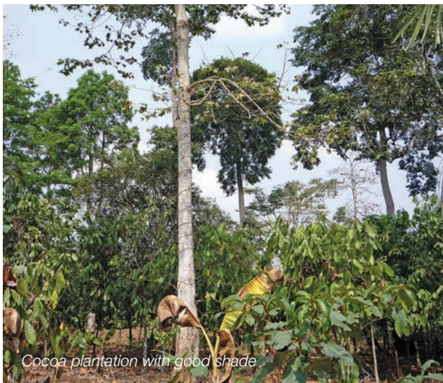
Cocoa plantation with good shade

The farmers believe that the trees planted will provide better conditions for their cocoa production through shade during the hot dry season, from leaf litter enriching the soil, and from reducing the incidence of some pests of the cocoa. As they do not have enough income to buy fertilizer to improve cocoa yields they hope the trees will help recover the productivity of the cocoa. Also they hope the trees will help recuperate the water sources around their farms and communities that have been drying up during the recent strong dry seasons.