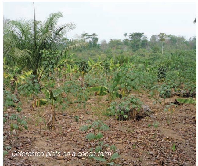
Deforested plots on a cocoa farm

Pur Projet offers Fairtrade and other socially and environmentally responsible companies, such as Chocolat Halba, a service of managing environmental investments in developing countries to inset the social and environmental benefits that the companies wish to generate, and at the same time strengthen the sustainability of their suppliers. One of the main means is through the management of reforestation projects where companies wish to improve the environmental sustainability of the communities they buy from, and potentially generate carbon credits the company can buy to offset their own emissions. They work with the producer organizations to design reforestation projects that meet the farmers needs, ensure quality trees and management, and develop a control system so that the number and growth of the trees can be monitored and provide accountability for the project. Pur Projet issue tree planting certificates against which companies pay the costs of the reforestation, Pur Projet receive about a third of the funds for their services. If the project is large enough (over half a million trees per year) they can be used as the basis for developing a carbon offset project against the voluntary carbon standard, in which case the carbon credits can be sold to any interested buyer.